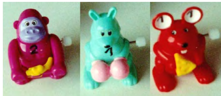
Fig. 2: Somersaulting animal toys with a wind-up spring.

First of all, I made a film of some of the kangaroo's flips using a video camera with a high-speed shutter of 1/2000 s. Figure 3 shows the series of nine pictures scanned into the computer.