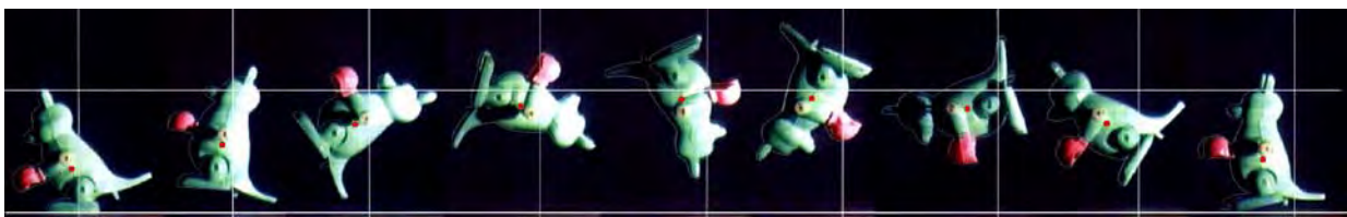
Fig. 3: Series of video images of a back somersault (kangaroo). The images have a time lapse of 1/50 s (video half-frame lapse). The horizontal lines correspond to a distance of 5cm; the red dot on the green figure marks the approximate center of gravity.

First of all, I made a film of some of the kangaroo's flips using a video camera with a high-speed shutter of 1/2000 s. Figure 3 shows the series of nine pictures scanned into the computer.