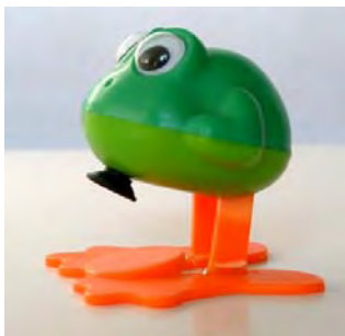
Fig. 1: Somersaulting frog.

So-called somersaulting toys are small articles sold in toy stores that can do one or more back somersaults from a standing-position. There are two different versions of them that I am familiar with. The Somersaulting Frog (figure 1) has inside a spring that is pressed down and fixed to the ground by a suction cup. After a short while, the suction cup comes loose, and the energy stored in the spring is sufficient for a complete backflip. The second version (a kangaroo, gorilla, or mouse from the Japanese company TOMY) has a spring-winding tension that, in turn, tensions a second spring that is then suddenly slackened (figure 2). This toy can make up to seven backflips, one after the other. I will analyze the second kind of toy using the kangaroo as my example and then comparing it with a back somersault performed by a human. All my observations are primarily estimates and approximate calculations since more exact analysis would demand much more time and effort and not bring much additional knowledge or insight.